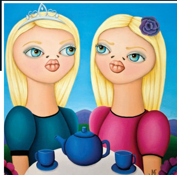
My own worst enemy - 2011, Oil on canvas, 80 x 80 cm

Drinks + Nibbles provided. RSVP by email or phone by 23rd April