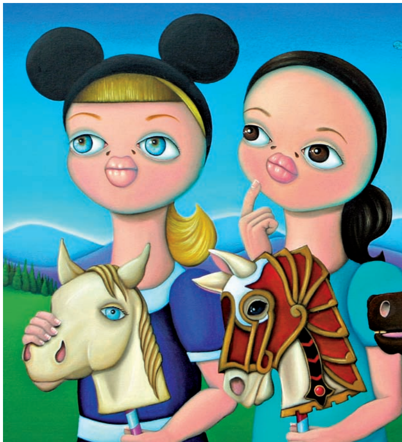
CHILD LIKES ... A detail of JME Pool's The Revelation captures images from an idyllic age

CLOCKED OUT: AMAZING WOMEN 3 // From modernism to minimalism, celebrate the diversity of music